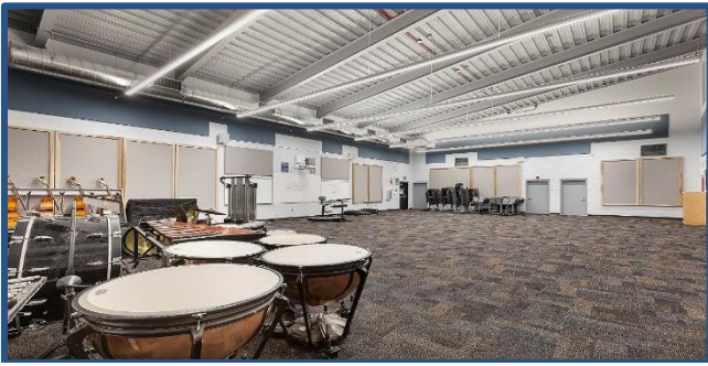
Carmel Valley MS / Music & Drama