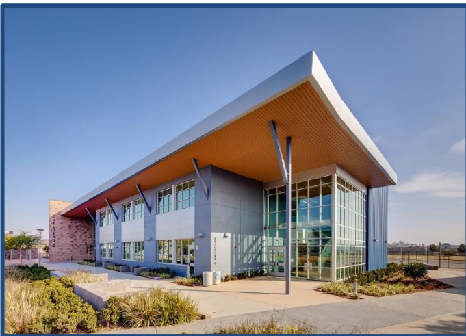
Pacific Trails Middle School / 2 nd Classroom Building

The projects mentioned in this annual report, including the Performance Audit, Project Status, Master Plans, and ICOC actions can be found at the ICOC page.