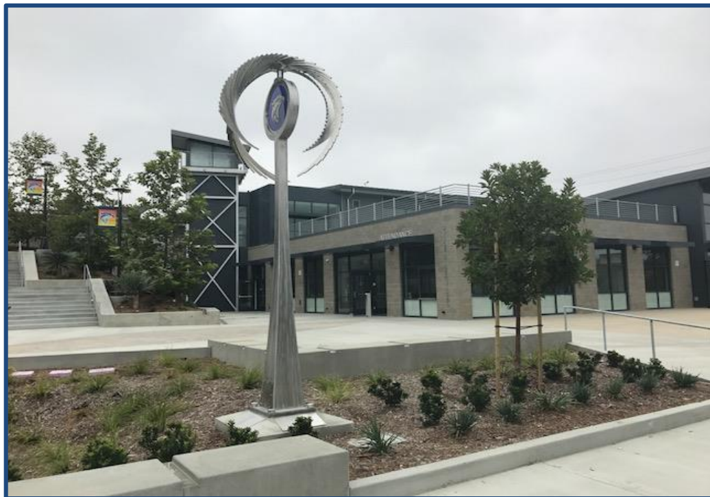
ENR's - 2018 Best Project, So. California, K-12 Education / Earl Warren MS