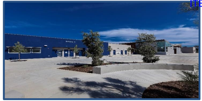
Oak Crest MS / Science Classroom Quad