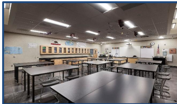
Oak Crest Middle School Science Classroom