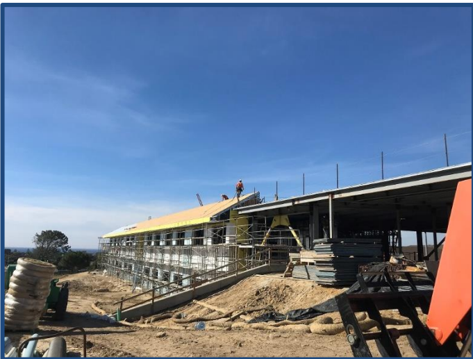
San Dieguito HS Academy / Arts & Humanities Building