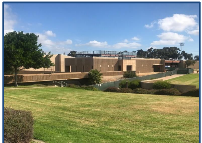
Torrey Pines HS / Performing Arts Center (PAC)